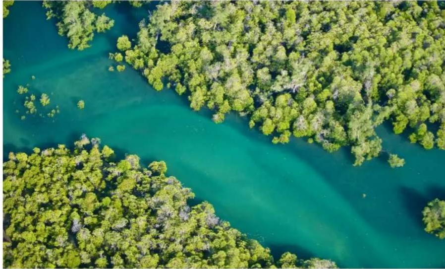
▲ Mangroves in Morondava, west Madagascar. The UN has described coronavirus as an 'SOS signal' for humankind.

Pandemics such as coronavirus are the result of humanity's destruction of nature, according to leaders at the UN, WHO and WWF International, and the world has been ignoring this stark reality for decades.